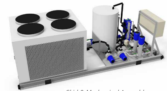
Skid & Mechanical Assembly