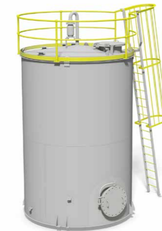
API650 Tank Design