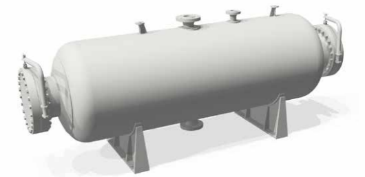
AS1210 Pressure Vessel